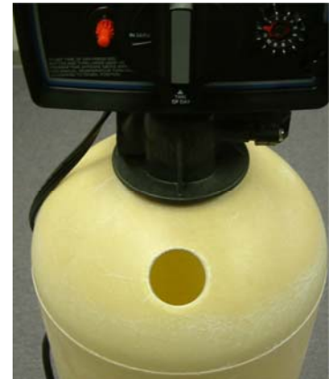
Dome hole plug removed.