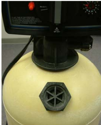
Dome hole plug in.

About a pint of water will leak out onto the floor. If you don't want to get the floor wet, place a towel at the base of the filter.