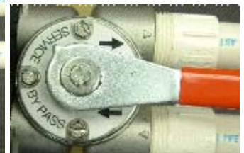
Valve in the "service" position.